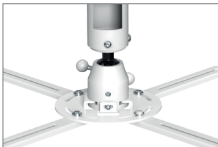
multidimensionally adjustable thanks to the ball joint