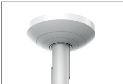
stable ceiling mounting plate

The surface of the ceiling mount is finished with an impact- and scratch-resistant powder coating in white.